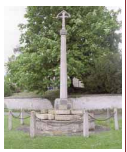
Colsterworth before work

In 2009, Colsterworth and District Parish Council applied to the Grants for War Memorials Scheme. There was concern over the on-going structural stability of the memorial as it had some vertical cracking to the shaft and some damage to areas of the masonry. Another serious concern was the condition of the Christ figure. This had been subject to some heavy erosion, though it was felt that it could still be 'read' as a depiction of Christ on the cross. Finally there were concerns over the condition of the surrounding posts, the presence of pollution deposits on the memorial and the inscriptions.