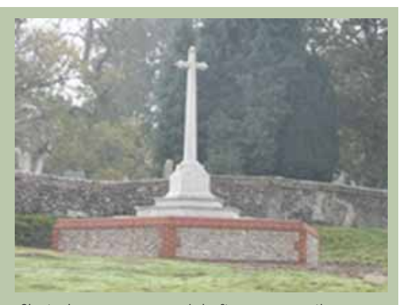
Shotesham war memorial after conservation works

The listing application was made following a grant from the Grants for War Memorials Scheme. This had supported works to deal with the consequences of the original coping of the wall and gravel being removed and replaced with concrete slabs