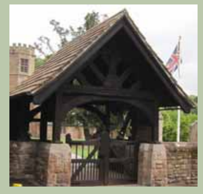
Wetheral lychgate

In 2009, War Memorials Trust gave a grant of £2,058 towards a comprehensive programme of conservation and repair work to the memorial. These works included the re-building of the sandstone wall in one corner of the memorial as the joints had opened up; all re-pointing was undertaken in lime mortar. The gutters and downpipes were also replaced as they had rusted. New pieces of oak were used to replace the rotted sections of oak on the eaves and a section of the frame which had dropped was re-fitted. Sandstone roofing slabs were replaced where they were broken or lost. A colourless wood preservative was applied to the whole memorial. In addition, a new oak memorial plaque was added to the memorial to record the name of Corporal Sarah Bryant who died in Afghanistan in 2008.