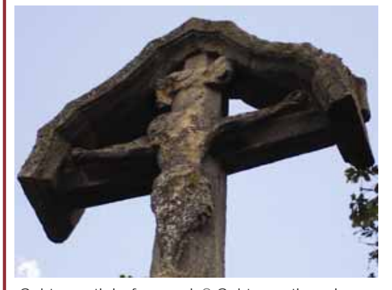
Colsterworth before work

In November 2009, the Council was awarded the sum of £5,256 against a total project cost of £10,512. The project was developed following the commissioning of a condition survey. This survey recommended that that the pollution deposits on the memorial be removed with an ammonium carbonate, clay and paper poultice and that the Christ figure was then repaired using mortar and a shelter coat applied. It also looked to replace four stones to the plinth, clean the pavement, remove cement mortar and re-point using lime mortar, replace three posts with new replicas and re-guild the inscriptions.