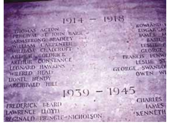
Legibility of inscriptions improved through minimal cleaning methods and limited re-cutting