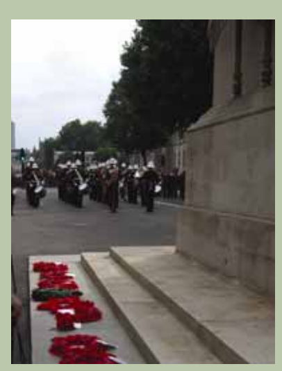
Tributes laid at the Cenotaph for the VJ Day commemorations

So, on behalf of the Trust I would like to wish you a very Merry Christmas and a Happy New Year. We will be back in touch very soon in 2011!