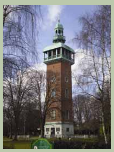
Carillon War Memorial in Leicestershire © Liz Blood, 2010