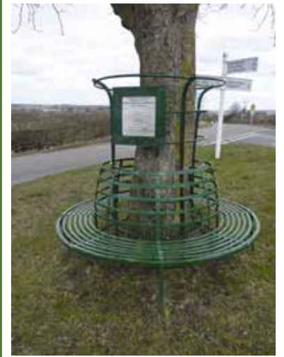
Bringhurst war memorial seat, an unusual memorial in Leicestershire

sending news releases to national and specialist publications.