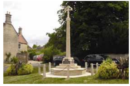
Colsterworth after work

"Remember our noble dead of the wars 1914-1918 1939-1945 may they rest in peace"