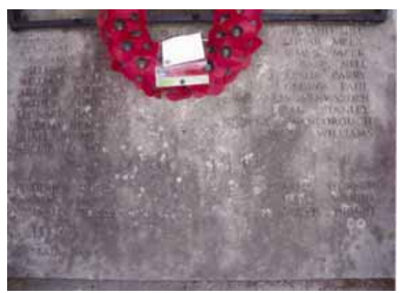
Inscriptions illegible due to pollution deposits and natural weathering

"1914 – 1918 And also of 1939 – 1945 We will remember them"