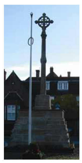
Holt war memorial

In 2010, War Memorials Trust gave a grant of £2,470 towards a large project to address the deterioration of some elements of the stonework. The memorial was cleaned with low pressure water and non-metallic brushes primarily to remove the pollution deposits on the stone, as these can be damaging. All of the failed and open joints were re-pointed with a hydraulic lime mortar mix (with no cement as this can be damaging to historic stone due to its impermeability and inflexibility). As some of the stone was damaged beyond repair, like-for-like replacement was necessary in identified areas so new Clipsham stone was indented to address these issues. This also required that two small sections of lettering had to be re-cut and indented; this was done in a style to match the rest of the lettering so that once the new stone has weathered it will look homogenous.