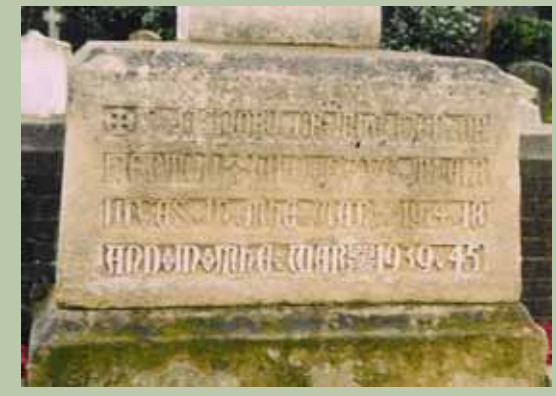
An example of raised lettering discussed on the new inscriptions page

In addition, we have added a section looking at inscriptions. This is designed to help people trying to identify if the inscription on their war memorial needs work at this time or whether it should be monitored (re-cutting too soon can reduce the life span of lettering so it is important to only cut when required).