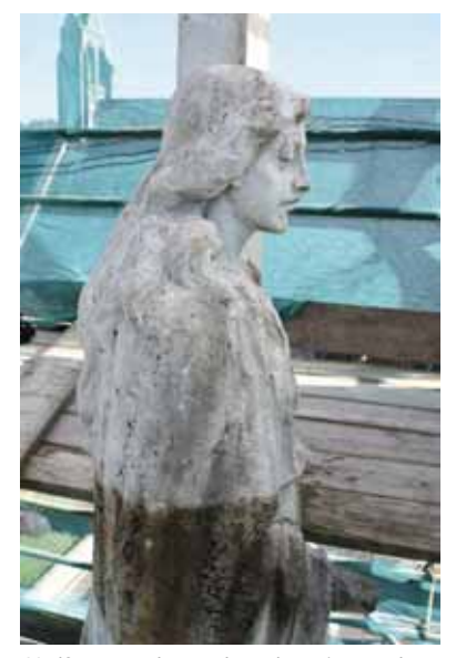
Half-way through cleaning, the extent of the deposits on the marble sculpture is highlighted