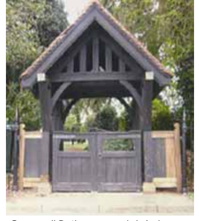
Cropwell Butler memorial during conservation

Once the restoration work had been completed, the Trust identified the memorial as suitable for listing and a request for help with the application was added to the Regional Volunteer section of the Trust's website. The charity encourages volunteers to list war memorials as a way of providing