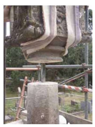
Taking the crown off the top of the cross reveals the copper dowel in need of replacement inside

stronger material for this function. They are also non-ferrous so will not cause any future damage to the stonework through rusting, which is a problem with ferrous fixings. Additional stainless steel dowels were added between the base and the plinth to increase the support where the cause of the lean was identified. The cross was rebuilt plumb using lime mortar, and all the dowels were run in resin.