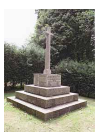
Doddington and Newnham war memorial after completion of conservation work

"Historical: as a permanent testament to the sacrifice made by this community in two World Wars it is of strong historic and cultural significance both at a local and national level.