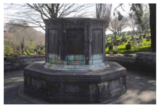
Plymouth Blitz war memorial before conservation works showing the build up of algae and metal staining

During the works it became apparent that further stone repair was required. Both stone repairs were undertaken on a like-for-like basis. These were indent repairs as the damage was too deep to be addressed using mortar repairs and this alternative method allows for the most retention of original material. In addition to this, it became apparent the memorial was retaining moisture and this had been the cause for the heavy algae build up. The use of lime mortar should encourage the drying out of the memorial over time. The project was delivered under budget and, as such, the final grant awarded was £6,880.