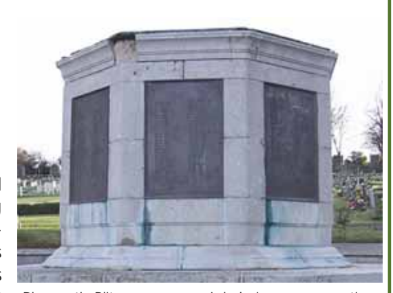
Plymouth Blitz war memorial during conservation works showing the metal staining and stone damage after cleaning