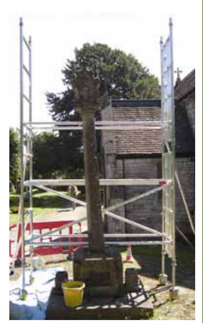
Prior to works, the lean of the memorial is evident © Benjamin & Beauchamp Architects Ltd, 2010

Upon inspection, it was identified that the source of the lean was at the plinth to column joint. Scaffolding was erected and the column and crown of the cross were dismantled; this process uncovered that the dowels supporting the structure internally were copper (a malleable metal) and were also considered to be too short. Therefore, the copper dowels were replaced with stainless steel which is a more suitable and