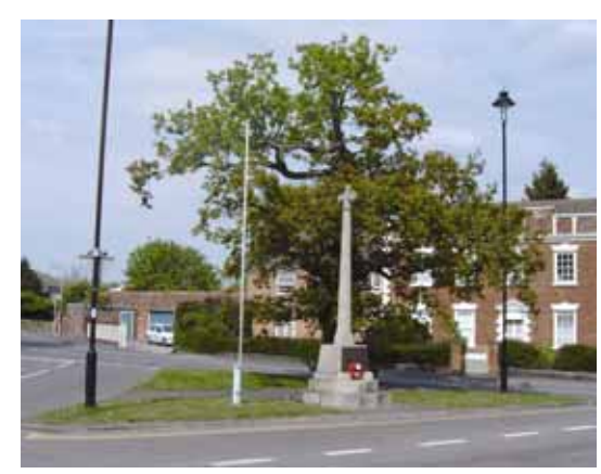
Cannington war memorial