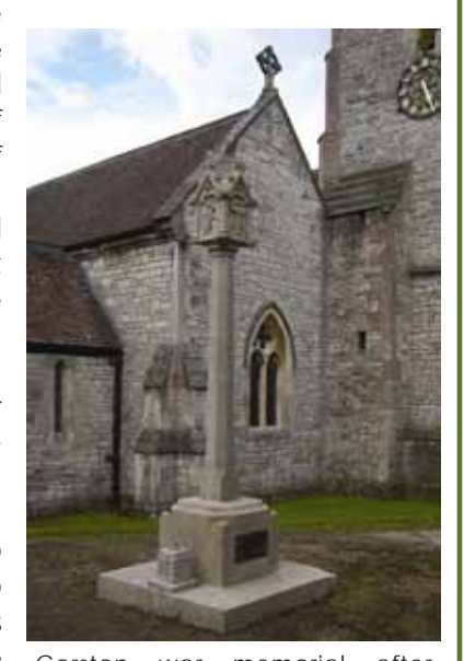
Corston war memorial after completion of works © Benjamin & Beauchamp Architects Ltd, 2010

Open joints were re-pointed in lime mortar and a poultice was applied to reduce some of the copper sulphate staining on the stone below the metal plaques; poultices work through capillary action to draw out staining, but it is very difficult to completely remove this type of staining as it penetrates deep within the pore structure of the stone. In addition, a broken finial on the top of the crown was re-fixed with a stainless steel dowel.