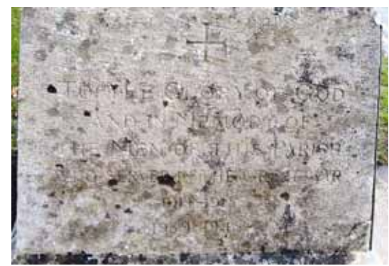
Cannington war memorial inscription before restoration