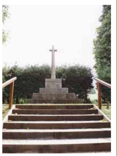
Doddington and Newnham war memorial after completion of conservation work

"In grateful memory of the men from Doddington and Newnham who gave their lives for their country in the Great War 1914-1919"