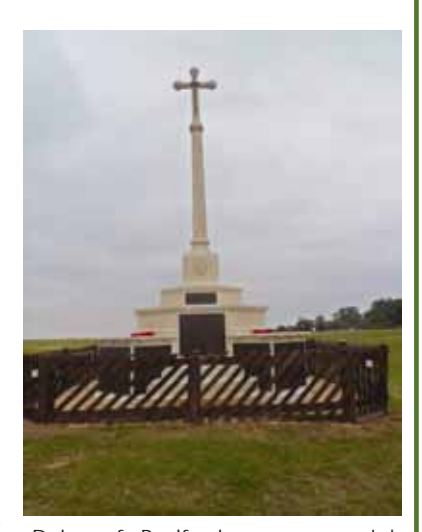
Duke of Bedford war memorial after repair © WMT, 2013

the property of the town council. In addition the applicants took advantage of In Memoriam 2014. This project is designed to increase the protection of metal elements on war memorials by offering SmartWater free of charge to custodians.