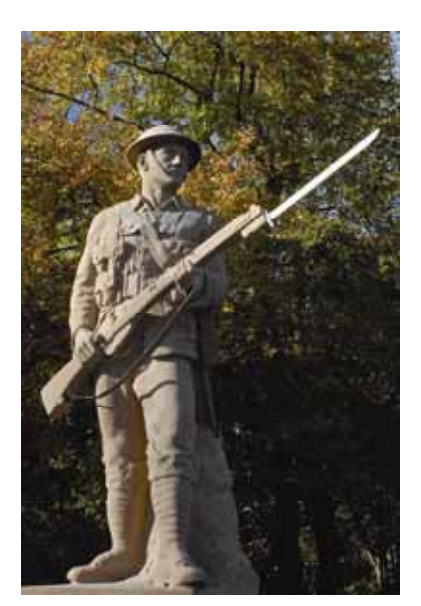
The soldier on completion of the works

If you wish to discuss the cleaning of a war memorial, or any other conservation works with the Conservation Team then please do contact us by email at conservation@warmemorials.org or telephone 0207 233 7356. The Small Grants Scheme is now being assessed quarterly due to the level of interest in the scheme so it is important that grant applications for conservation projects are submitted well in advance of the desired completion date in order to allow plenty of time for your application to be considered.