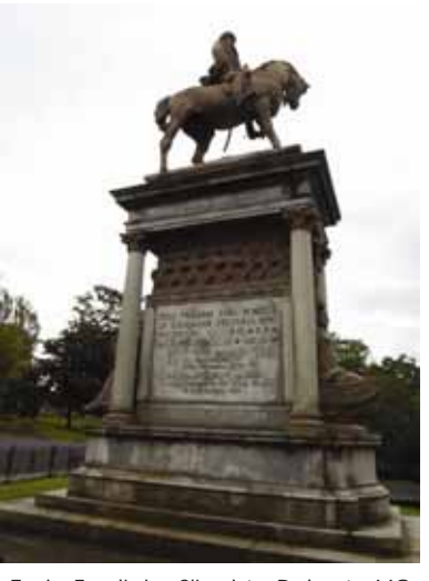
Earl Fredick Slieght Robert VC memorial in existing condition

For further information on all the CMRF grant offers which have been made please visit the press section of our website www.warmemorials.org/news. In the next few months we look forward to hearing about completed CMRF projects and hope to be able to provide some case study examples.