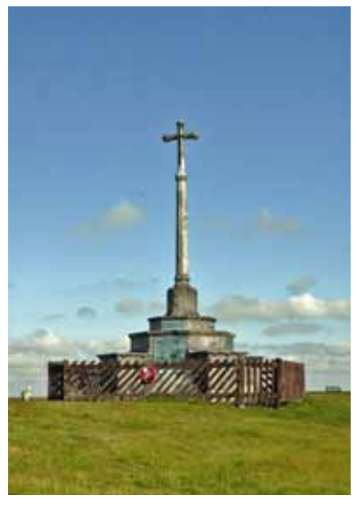
Duke of Bedford war memorial before repair

In 1970 ten of the plaques were stolen. In 2012 an application to the Grants for War Memorials scheme was made to replace the stolen plaques, as a record of the names had recently come to light, clean and treat the remaining plaques and clean and make minor repairs to the stone. A grant of £21,397 was offered towards a project cost of £64,934.