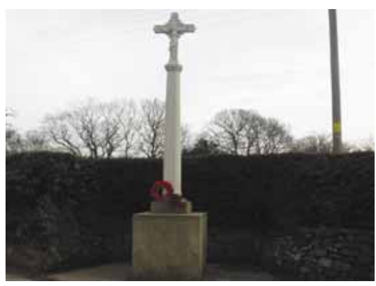
Little Ness war memorial

These include Little Ness war memorial (WM1907) which was awarded a grant from the Grants for War Memorials scheme in 2007 for works to clean, re-point and address the condition of the lettering. The memorial was listed at Grade II in February.