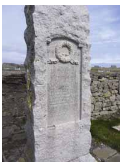
Fair Isle war memorial in existing condition