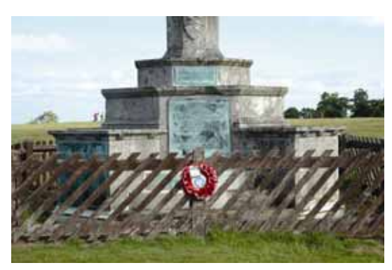
Duke of Bedford war memorial before repair

The war memorial consists of a Latin cross atop a three tiered hexagonal base with projecting pedestals. On the cross head is a bronze sword and the ends of the cross arms and capital have carved foliate detailing. The memorial is Grade II listed and constructed of Portland stone. It originally had twelve bronze plaques making up the roll of honour with additional bronze dedicatory plaques. The memorial sits within the Grade II registered Ampthill Park and is on the boundary of a Scheduled Ancient Monument.