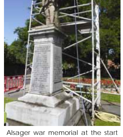
of works © L. Bickerton, 2013

can stain and cause damage to stone so it is important that any ferrous