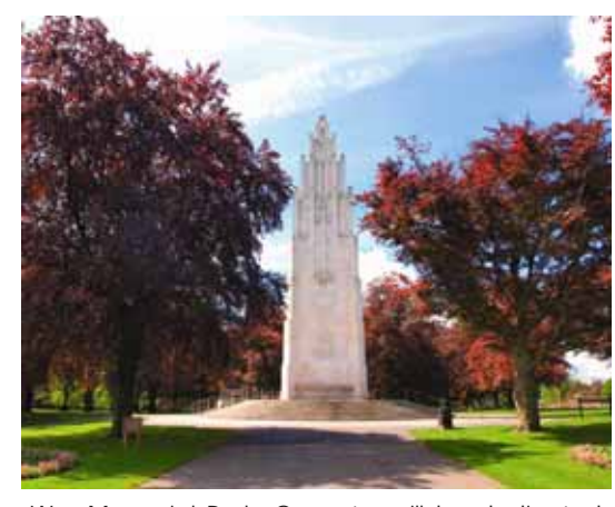
War Memorial Park, Coventry will be dedicated as a Centenary Field © Fields in Trust, 2014

"We are inviting every local authority in the UK to nominate at least one recreational space to be dedicated as a Centenary Field. It will be a key way in which they can commemorate this significant milestone in our history and to create a living local