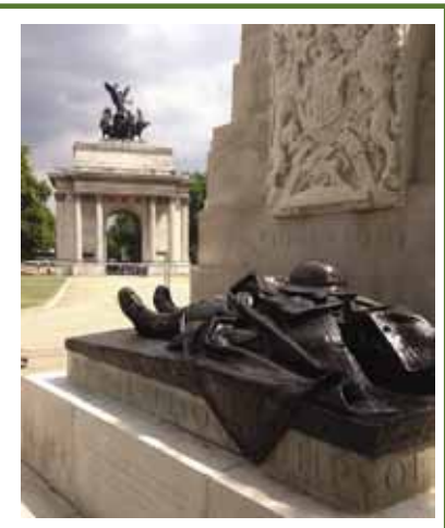
Royal Artillery Memorial

The Greater London Authority is hosting Exploring London's First World War Memorials at City Hall (next to Tower Bridge) from 4<sup>th</sup> August - 12<sup>th</sup> September and 3<sup>rd</sup> - 28<sup>th</sup> November. It features new images exploring the diversity of London's memorials. See www.london.gov.uk/get-involved/events/exploring-londons-first-world-war-memorials.