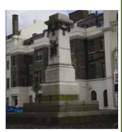
Indian Mutiny memorial, Dover

The Trust is aware of a number of recent additions to the list including the Indian Mutiny memorial, Dover (WM7770) which, following an application from the Trust, has been successfully listed at Grade II. The memorial, in the form of an obelisk, was erected in August 1861 by the First Battalion of the 60th Royal Rifles to commemorate comrades lost in the Indian Campaigns of 1857 in Oudh, 1858 in Delhi and 1859 in Rohilkhand. The listing of this war memorial shows that it is not only World War I memorials of interest so if you have local war memorials from any conflict which could be listed you can apply. The full listing description can be viewed on English Heritage's website: http://list.english-heritage.org.uk/resultsingle.aspx?uid=1420014.