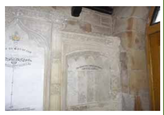
Memorial before conservation and repair work

In March 2014, conservation works to the memorial were undertaken to address the highlighted issues. Loose materials were carefully removed using soft natural brushes, salts were drawn out of the memorial using a poultice of acid-free tissue paper pulp and clean deionised water. To remove surface soiling light cleaning was undertaken prior to the limestone consolidation works which included filling cracks with a repair mortar specifically designed to match the host material in terms of colour, texture and durability. Corroded fixings were removed and new stainless steel fixings were installed and the impact of graffiti was greatly reduced. Finally, the inscription on the central panel, which had been effected previously by un-sympathetic works, was re-painted to match the flanking panels and to improve the legibility.