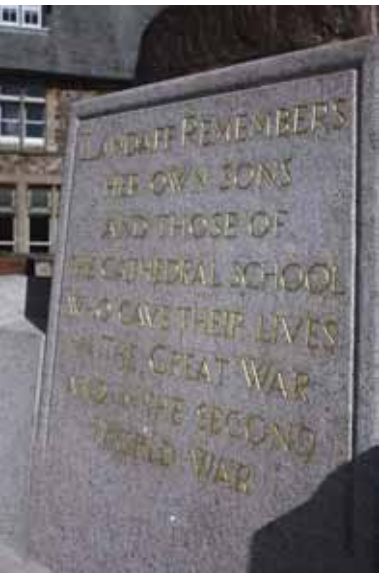
Re-guilded lettering on the central plinth of the memorial

water, non-metallic bristle brushes and a pH neutral soap. The remnants of enamel paint were removed from the statues using white spirit and the bronze was then rinsed again using clean water and brushed with nonmetallic bristle brushes. The statues were then carefully patinated and waxed for protection. Waxes and oils are used for protecting natural and artificial patinas of metal elements. They should initially be applied hot to allow the wax to penetrate pores and provide a better coverage. Several coatings may be required before adequate protection has been ensured. The wax can last two to three years in nonexposed climates before it needs to be reapplied.