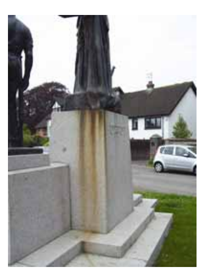
Staining caused by ferrous fixings within the structure

In 2013 War Memorials Trust offered a grant of £2,309 towards the repair and conservation of the war memorial. The bronze statues were previously treated with a black patination which had weathered and there were many areas of verdi gris (blue/green staining) visible. There was also evidence that enamel paint had been applied to the bronze statues in the past in an attempt to cover exposed areas and this was causing damage to the statues. Paints and lacquers are sometimes applied to bronzes to cover up the natural green patina or damage to the metal sculptures, however these will not prevent deterioration and can cause more damage in the attempt to remove them. Furthermore, on the central bronze figure there appeared to have been an issue with some of