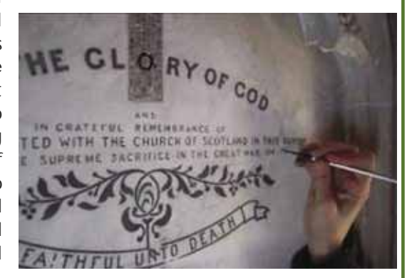
Repainting of the inscriptions © Nicolas Boyes Stone Conservation, 2014