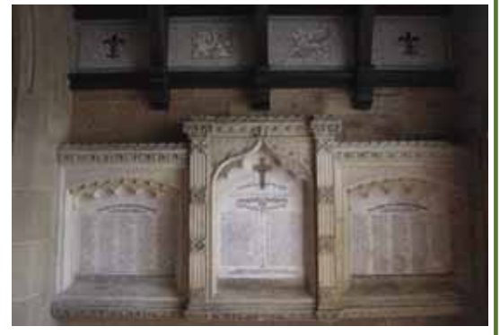
Memorial following conservation and repair works © Nicolas Boyes Stone Conservation, 2014