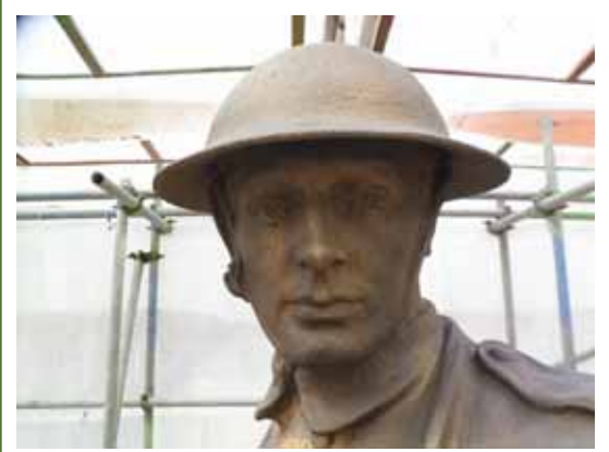
Detail of sculpture after lacquer removal but before treatment

The main part of the works was the cleaning and repatination of the bronze. This had historically been inappropriately cleaned and a type of bronze coloured lacquer applied which had started to break down allowing water to become trapped underneath causing the bronze to deteriorate. The first stage of the project was to establish an appropriate method for removing the lacquer. It was determined that the use of a dichloromethane paint stripper and steam cleaning was the most effective and least invasive way for this. This removal allowed for the condition of the bronze to be fully evaluated.