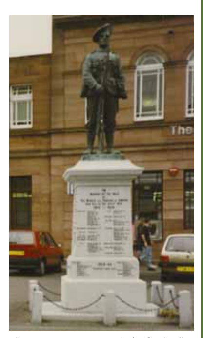
Annan war memorial