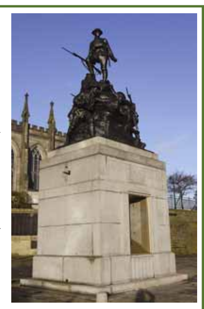
Oldham war memorial after repair

An application for funding towards this project was received in 2012. The main concerns were the condition of the bronze and the memorial book. Due to the high costs of this project, quoted at £73,640 for the eligible elements, a grant of £30,000 was offered. The works to the World War II mechanised memorial book were not eligible for funding as only one quote had been received for this.