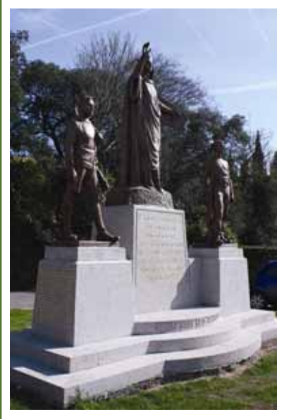
Llandaff war memorial on completion of the works

Cleaning of bronze is required periodically for the removal of pollutants and damaging deposits on the surface of the metal. Cleaning should be delicate enough to avoid damage to stable patina whilst effectively removing unwanted coatings. For this reason the statues were first cleaned using distilled