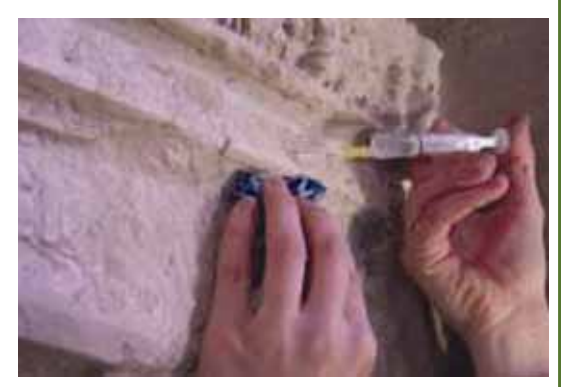
Injecting acrylic resin into the memorials cracks