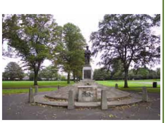
Heath Town war memorial before stage I works

of £250,500 has been offered to 31 projects throughout England from the first 3 rounds. It is believed that this increased interest has been generated by the World War I centenary and we hope it is a trend which will continue through out this period. This increase also highlights the importance of the recently announced funding from the Department of Culture, Media and Sport. This will support War Memorials Trust in its work to assist communities to conserve their memorials through our advisory role and one-off, additional grant funding for World War I memorials.