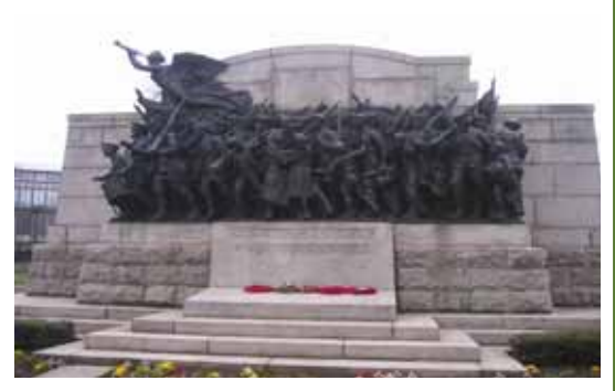
The Response/Northumberland Fusiliers Memorial in Newcastle \ensuremath{\,^\circ} WMT, 2010