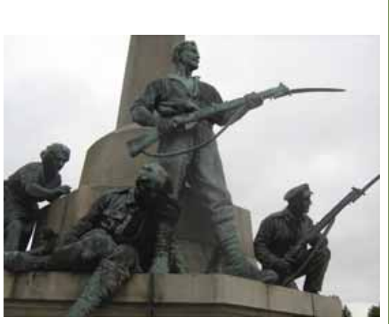
Port Sunlight memorial, showing sculptural group modelled on the 'Defence of the Realm' theme @ WMT, 2010