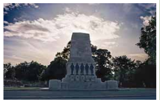
Guards Division memorial

groups on any memorial nationwide and felt it thoroughly deserving of the highest listing grade.