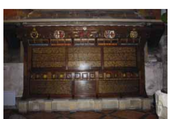
The memorial following conservation works

St Augustine's Church in Penarth houses a roll of honour dedicated to those who fell in World Wars I and II. The memorial is a large screen made of Italian walnut on a stone pedestal. At the top there are rich decorative carvings including the Welsh Dragon in the centre flanked by the arms of the Diocese of Llandaff and arms of the Earl of Plymouth and flags. The names of more than 200 of the fallen from World War I are recorded in gilt lettering. Below the inscriptions are carved and painted regimental badges. Originally the bottom of the screen had linen fold carving but later the gilt names of the fallen from World War II were added. The Church is listed and located in a conservation area. It was unveiled on Monday 9<sup>th</sup> August 1920.