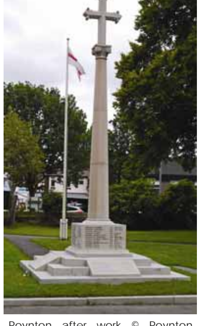
Poynton after work