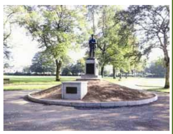
Heath Town war memorial after stage I works