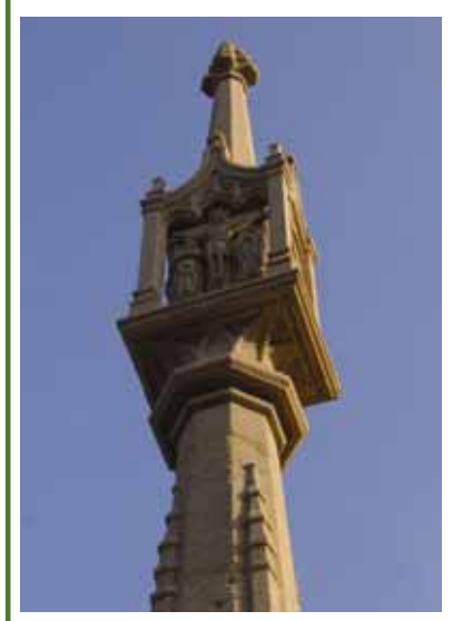
After works

Stratton on the Fosse war memorial is located at the junction of Church Lane and Fosse Road (A367) in Stratton on the Fosse, Somerset. The 15th century style Doulting stone memorial has a two-stepped octagonal base supporting a square plinth which carries the inscriptions. The plinth is surmounted by a tapered shaft with an elaborate calvary cross featuring the figures of Christ and St Vigor in the lantern. The inscription commemorates those who took part in both World War I and II. The lettering is inscribed into the four recessed stone panels in the square plinth. The war memorial is Grade II listed.