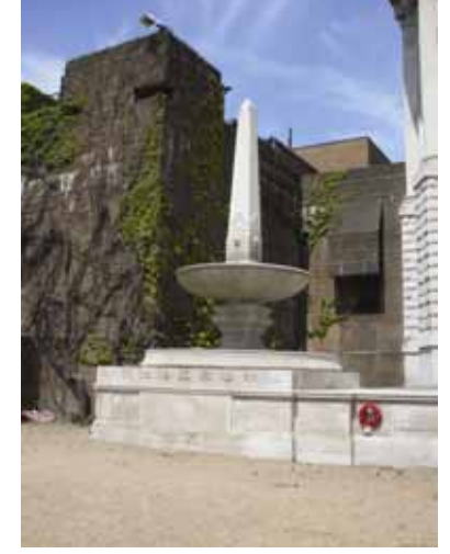
Royal Naval Division, London (WM55)