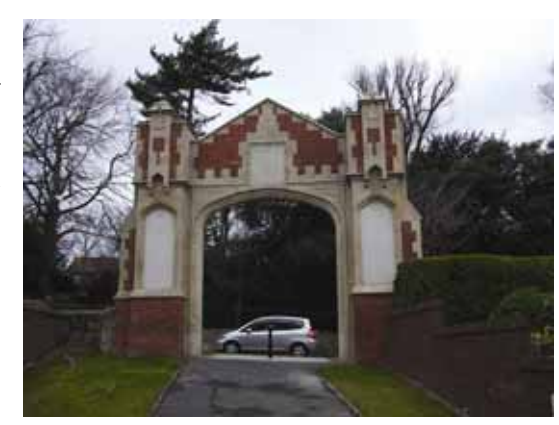
Above and below: Ascham St Vincent, East Sussex

War Memorials Trust first became aware of Redditch war memorial outside St Stephen's Church in Worcestershire via local news reports about anti-social behaviour (WM5435). We do not currently hold any photographs of the memorial and