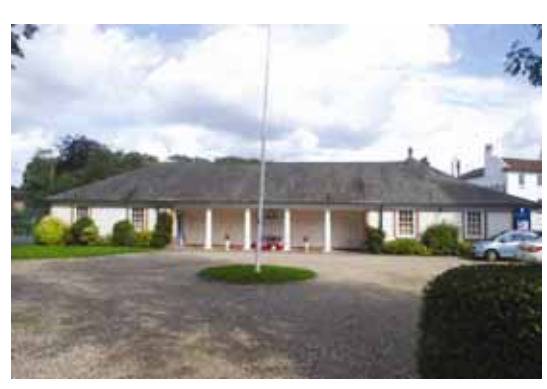
Gerrards Cross, Buckinghamshire (WM9718) © Paul Stamper, 2015

As Roger Bowdler, Director of Listing at Historic England, said when the outcome of the review was announced in November: "Lutyens was a key figure in determining how the dead and missing should be commemorated. His designs are admired for the universality of their message. His pure architectural forms are mute symbols of grief, the simple inscriptions weighted with sorrow. These are enduring memorials, which show the power of classical architecture to convey meaning and dignity."