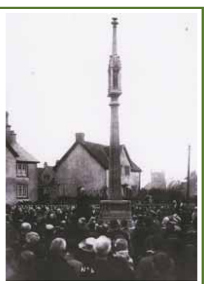
Dedication photo from St Benedict's Parish History book © Stratton on the Fosse Parish Council, 1920

In 2001, War Memorials Trust contributed £100 towards gentle cleaning work as the inscriptions had become illegible.