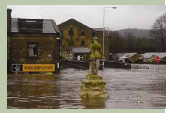
Mytholmroyd under flood water

One of the projects which has recently benefitted from a grant is shown on the cover. In 2015 the Caledonian Station Hotel roll of honour received £890. The memorial was found in a store cupboard in a Poor and fragile condition. It had a number of tears, the paper was discoloured and there was some smudged