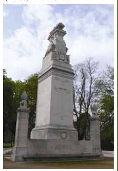
Southampton Cenotaph, Hampshire (WM2764)

memorial is listed you can either visit the Historic England website <a href="https://historicengland.org.uk/listing/showcasing/war-memorials-listing-project">https://historicengland.org.uk/listing/showcasing/war-memorials-listing-project</a> or email War Memorials Trust at <a href="listing@warmemorials.org">listing@warmemorials.org</a>.