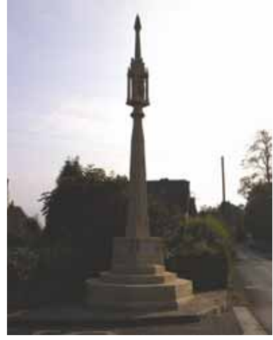
After works © Stratton on the Fosse Parish Council, 2015