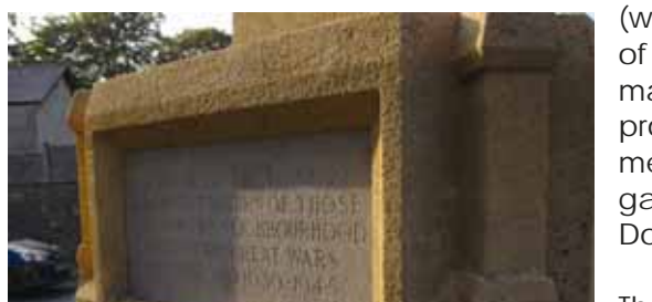
After works

Memorials can receive multiple grants. This could be for phased works or, if for similar works then a reasonable period of time should have elapsed. Part of a grant recipient's Grant Contract is an expectation of regular maintenance to ensure that funded grant works are sustained.