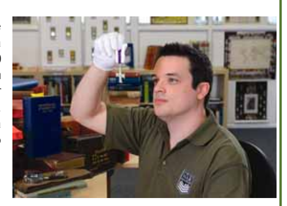
Forces War Records staff are trained to answer your questions on medals, uniforms or documents

Data interpretation experts transcribe and de-code original documents to provide accurate details. These records cover all of the major British conflicts from the 1700s onwards including specialist collections such as 'MH106 – the World War I Hospital Admissions and Discharge registers' and 'WO417 - Daily Reports