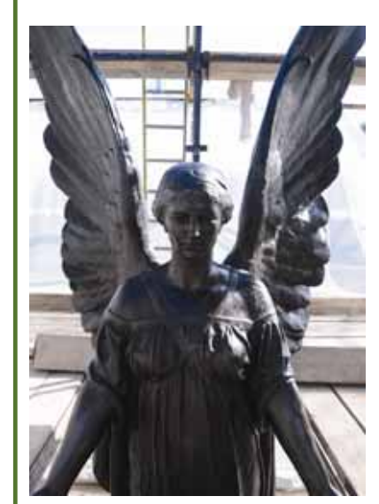
After specialist conservation work

In 2014 a grant of £17,900 was offered towards proposed conservation and repair work. The stonework