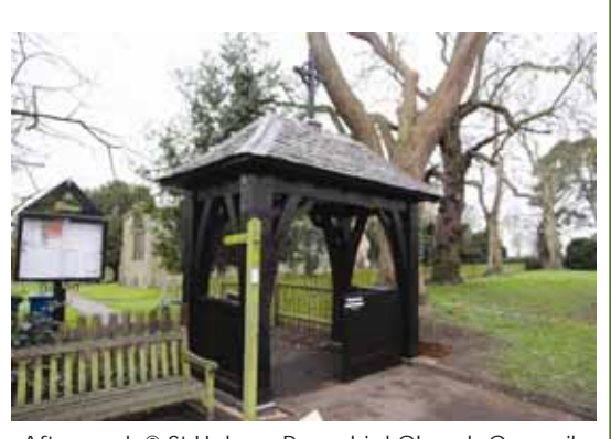
After work

the names on a war memorial. The research aspect of a project can be a great way of engaging the wider community and working with local or family history groups, civic societies, local media and others. However, if efforts are made to research a memorial but nothing can be uncovered a project can still receive grant funding.