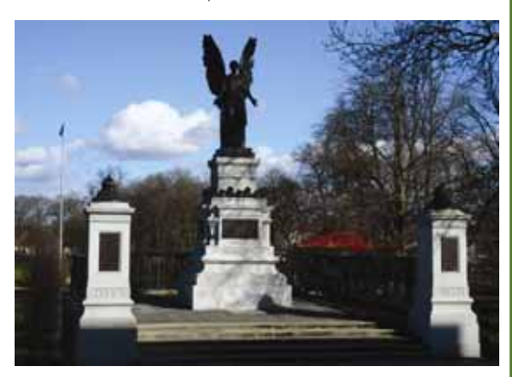
After work

In 2014 a grant of £17,900 was offered towards proposed conservation and repair work. The stonework