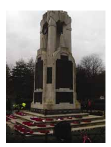
East Ham war memorial before Remembrance service (WM6514)

We were particularly pleased in November to be contacted by Grangewood Independent School in London. Ruth first went to this school on Remembrance Day 2014 and was invited back this year, again on 11<sup>th</sup> November. After delivering an assembly to the whole school Ruth accompanied the pupils from Years 1 and 2 (5 - 7 years old) to East Ham memorial (shown in the photograph to the right) for a service that was led by local schools. The assembly at the start of the day had explained to pupils what Remembrance Day is about, so when they got to the service the pupils understood what was happening and why. It was a pleasure to