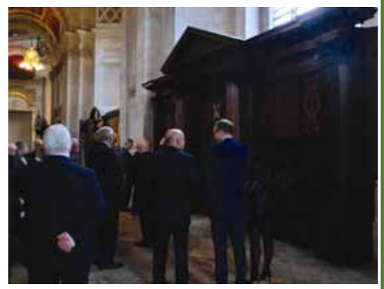
St Paul's Choristers memorial