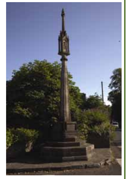
Before works

"In thanksgiving to God For the safe return of those Who from this neighbourhood Went to the Great Wars 1914 - 1918 and 1939 - 1945"