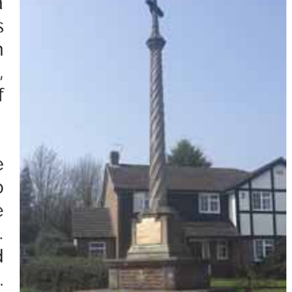
Cookham Dean before works