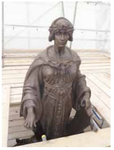
Cannon Hill Park Boer War memorial

War Memorials Trust's early work to assist with the centenary listing initiative involved identifying and applying for appropriate memorials to be upgraded. However, our focus has now moved to identifying those memorials deserving recognition at Grade II while Historic England lead on determining those at the higher grades. The Trust's focus has helped to ensure that many of the more simple examples of our war memorial heritage also receive the protection that listing offers. All our war memorials are important as poignant reminders of the effects of conflict and we seek to help ensure their long-term preservation.