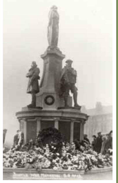
Bootle unveiling