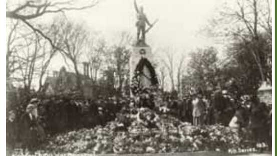
Worthing war memorial

In the last 20 years War Memorials Trust has helped 1,384 communities to repair and conserve their war memorials through the schemes it administers with more than £3 million of grant funding distributed.