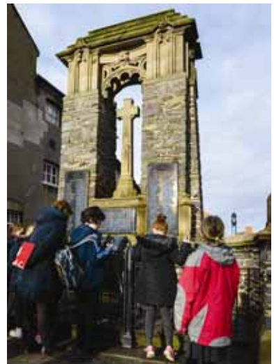
Pupils carrying out a condition survey and taking photographs of a local war memorial