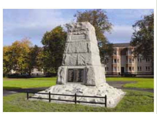
Yoker war memorial after works

In 2016, a grant of £3,660 was offered for repair and conservation work. To address the dirt and biological growth build-up, low pressure steam cleaning was undertaken. The extensive failed mortar was carefully raked out and then repointed using a lime mortar whilst repairs were undertaken to the base. Works to install a simple wreath holder and provide an access path were undertaken at the applicant's expense.