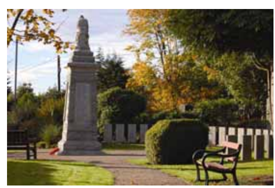
Tillicoultry war memorial after works

In 2016, a grant of £7,810 was offered for repair and conservation work. Failed pointing was potentially allowing water ingress through the construction joints. This may have influenced the biological growth appearing on the stone.