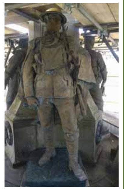
Bootle sculpture during works