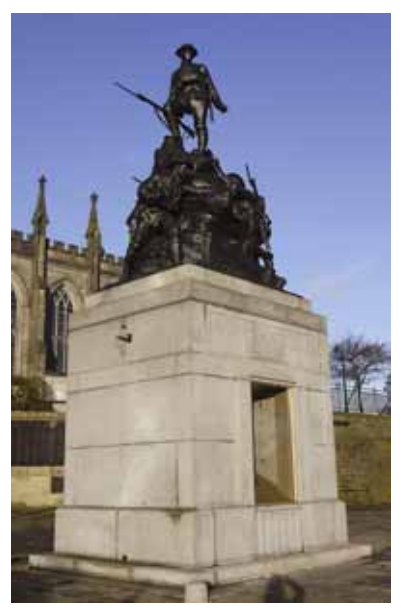
Oldham war memorial