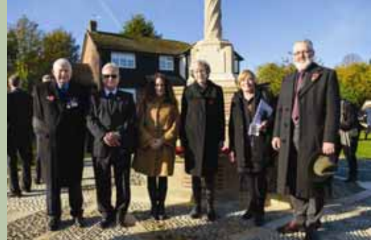
Cookham Dean rededication service with the Prime Minister in attendance

and Norwich roll of honour in Norfolk on pages 6 and 7. Both projects have been funded through War Memorials Trust Grant Scheme supported by the First World War Memorials Programme. As you may be aware this one-off additional government funding through the centenary of World War I is being distributed through grant schemes managed by War Memorials Trust. A further endorsement of these schemes has been received with the Directory of Change nominating the charity for its Great Giving Funders' Award, turn to page 4 for more information and another award nomination for the charity.