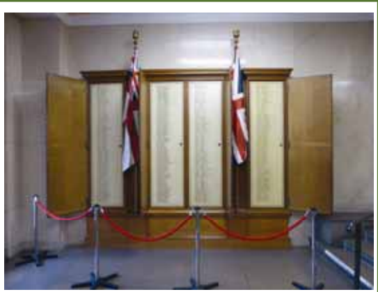
Norwich roll of honour after works