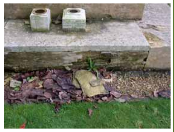
An example of damage caused by freeze thaw

Would you be able to visit your local war memorial, check its condition and take photographs to illustrate this? While we encourage members of the public and custodians of war memorials to check the condition of their local memorial annually, now is a particularly important time to undertake a condition survey. The cold and wet weather we have had over the winter period may have affected the condition of your local war memorial. Water freezing and thawing can cause cracks, as illustrated in the picture. On occasion heavy winds have caused tree branches to snap and damage the war memorial in their vicinity. Your local memorial may have been exposed to driving wind and rain over the winter, in addition, more extreme weather such as flooding may have also had an