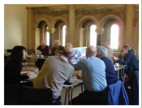
Regional Volunteer training on condition surveys in London