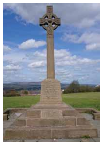
Grade II listed Huncoat war memorial (WM7619)

Over the past two decades War Memorials Trust has developed into the specialist organisation for war memorial conservation. Its Conservation Officers provide free advice and guidance to anyone who contacts the charity and also monitor the condition of war memorials through War Memorials Online, staff site visits, stories from the press and reports from Regional Volunteers, supporters or the public. To aid this important work the Trust has produced a range of helpsheets while also working with national heritage bodies to develop joint guidance on best conservation practice. We are incredibly grateful for the help we have received from national heritage bodies, as well as other civic and built heritage organisations and those in service and other sectors, to ensure war memorials remain a relevant part of our national culture.