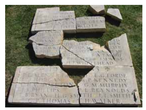
Damaged war memorial dumped in a skip

We really cannot do this without you. The memorial shown right was found in a skip in 2003. The Trust had to help get the pieces to safety, liaise with a storage location and then work with a company who agreed to fund repairs. Whilst it was not a grant case it is a great example of how the Trust is needed to help and support people and can facilitate preservation without grants. But it is work that does cost money. Much of our current increased turnover is due to specific restricted funding pots which cover programmes. To run the charity we still need to secure £400,000 unrestricted funding each year to deliver all aspects of our work including supporting our Learning Programme and volunteers.