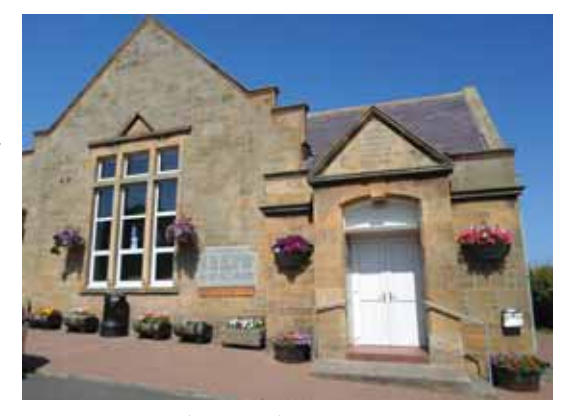
Hopeman hall (WM7887)

The nature of war memorial buildings can vary. Some may have a modest appearance as they were constructed at a time when raw materials were expensive and labour greatly reduced by the impact of war. Hopeman war memorial hall in Moray was erected in 1929 and is dedicated to the fallen of both World Wars (WM7887). Following a site visit by one of the Trust's Conservation Officers a Grant Offer of £7,940 to renew the timber flooring, roof and rainwater goods was made. The grant applicant commented that "everyone is delighted with the results. The funding has improved the hall and allowed the many groups who use it to carry on with their activities, which is essential to maintain the excellent community spirit which exists in the village." The Grade II listed King's School Memorial Hall in Bruton, Somerset is a very different type of hall (WM3812). The wooden panelling in the gothic style hall