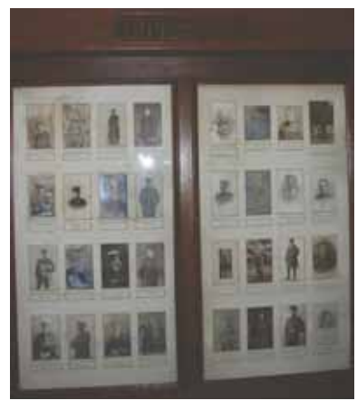
Ulverston Victoria High School (WM1356)

Some of these school cases reflect the huge diversity of war memorial styles in this country. Musical war memorials such as organs and bells have also benefitted from grants. The organ in Warleggan, Cornwall received £6,950 in 2012 whilst St Mary's in Comberton, Cambridge benefited from