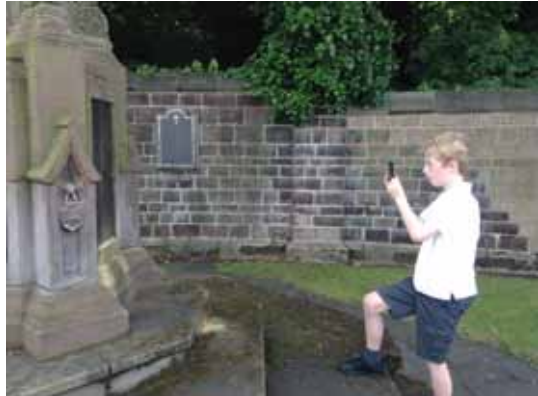
Above: Pupils at St Mary's School, West Derby, carrying out a condition survey of their local war memorial

were trialled during our very first school visits to Haymoor Middle School in Dorset in early 2012 and remain some of our most popular resources.