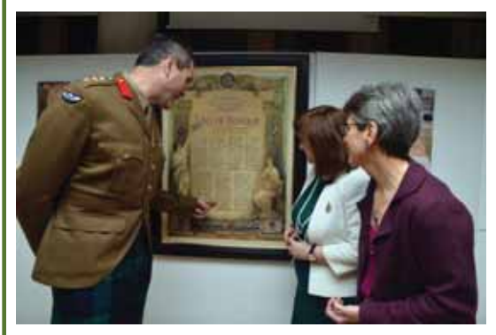
Guests at Holyrood reception

campaign to mark war memorials with SmartWater. These events have been an opportunity to raise awareness of the importance of protecting war memorials and generate coverage in both local and national media.