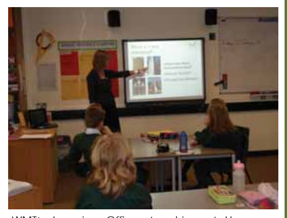
WMT's Learning Officer teaching at Haymoor Middle School