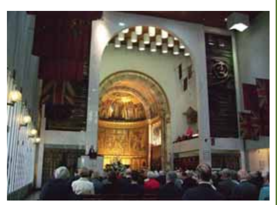
Guards Chapel service