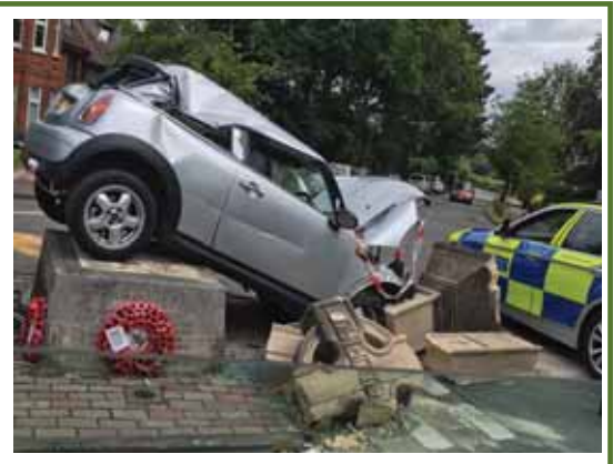
Damage to Shortlands war memorial after being hit by a car

Each and every day brings a new or challenging question or case. The funding and donations you give are vital in enabling the charity to provide professional and expert staff on the end of the phone, to respond to emails/letters or develop website content to help anyone, anywhere, get free of charge advice. Thank you for making this possible and if you ever need help please do get in touch using whichever channel suits you!