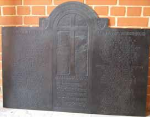
All Saints Church plaque before and after works (WM3587)

War memorial buildings and structures are often the most challenging cases we deal with due to their scale and the multitude of issues they raise. However, the charity recognises the important role these buildings can continue to play within their communities today. When giving a donation to support our work you may not have realised that some of the memorials helped have a social function alongside their commemorative role. This means that any gift you make can help not just the custodians but a far wider community whose use of these facilities and buildings is a very active form of commemoration. In such cases it is not just the Trust that thanks you for your donations but all those who use the war memorials.