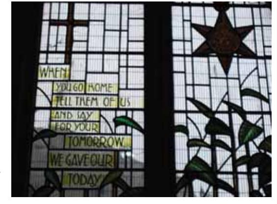
Above: Burma Star (WM1607) ; Below Cheltenham, Crimean (WM1855)

Throughout this piece we have included the reference number, beginning 'WM'. Using these numbers you can find out more about each case on the Grants Showcase on our website at <a href="www.warmemorials.org/search-grants">www.warmemorials.org/search-grants</a>. We have details of all the projects funded since 1998 offering both an insight into our work and its impact across the UK. None of this would have been possible without the contributions from our supporters. On behalf of all those who have received grants, and the charity which has the privilege and responsibility to distribute that funding, thank you for your gifts which make it possible for the Trust to give grants.