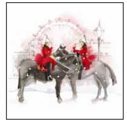
Merry Christmas and a Happy New Year