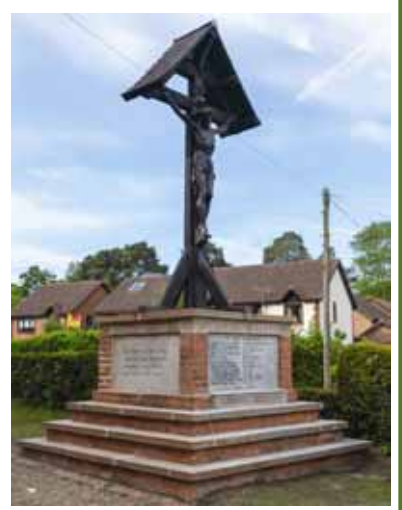
Ascot All Souls after works (WMO/147911)

However you donate it is greatly appreciated. The charity could not undertake its work without your help. Gifts support the protection and conversation of war memorials including projects such as the war memorial calvary at <u>Ascot All Souls</u> in Berkshire. A grant of £5,360 from War Memorials Trust Grants Scheme was administered to enable repair and conservation works. These included repairs to the calvary and the stonework, re-pointing of the construction joints (removing previous damaging cementitious mortar), improvements to the legibility of the lettering through repair or repainting while the whole structure was cleaned. The charity cannot deliver these grants without your assistance so thank you again to all supporters.