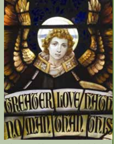
Above and front cover: St.Nicholas Church North Walsham (WMO/244652)

Simple yet powerful words from John 15:13 that adorn so many of our war memorials or will be spoken at the Remembrance services we attend. They represent the sentiments of communities as they created, or continue to create, the 100,000+ war memorials found across the UK which take so many different forms. From cenotaphs to plaques, halls to sculpture, crosses to bus shelters people have commemorated their fallen in many different ways but underpinning it all is a recognition of the sacrifice made by those being remembered which the above phrase expresses so succinctly. Our front cover shows those words as they appear on the stained glass window in St Nicholas church in North Walsham which recently received a grant discussed further on page 8. Alongside the efforts of custodians and communities the work the charity does, thanks to the donations of our supporters, ensures those commemorated by our war memorials continue to be remembered and the consequences of conflict recognised.