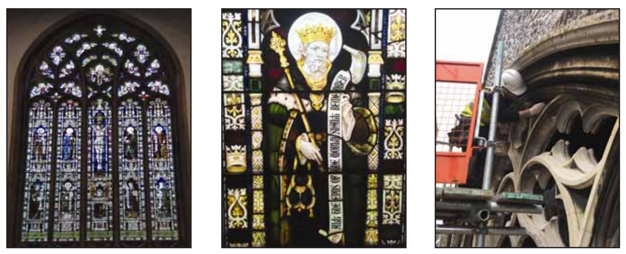
All images on this page and the front cover © PCC of St Nicholas Church North Walsham, 2019

In 2018, a War Memorials Trust Grants Scheme offer of £30,000 was made with the support of the First World War Memorials Programme. This assisted a project to undertake repair and conservation works to both the glass and the surrounding stonework. Agreeing the specification for works took time as it is a large and significant window so War Memorials Trust consulted with Historic England to ensure best conservation practice was informing the works. As a small charity we appreciate the support from the national heritage bodies in providing expertise for those materials or cases which are more unusual. With the diversity of war memorials we can never be sure what will be crossing our desk next and our small team cannot be experts on everything so we do discuss some cases with other bodies to ensure what is supported will be in the long-term interests of preserving a war memorial.