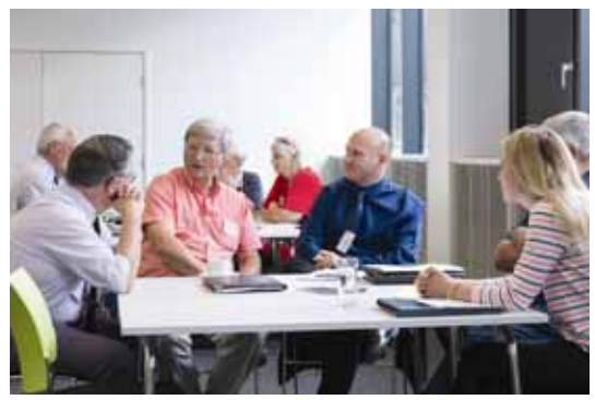
Attendees at a war memorial workshop in © Winchester Millson-Watkins/Historic Lucy England, 2018

If you have any questions, please contact us on info@warmemorials.org or 020 7233 7356.